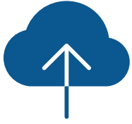
Analytics Master Data warehouse