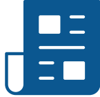
Report Manager Dashboards & reports