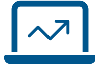
Visual Analytics Data visualization