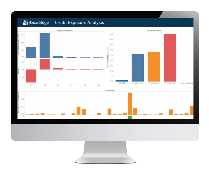
Visual Analytics: See and better understand your Investment Performance, Exposure and Market Risk Profile